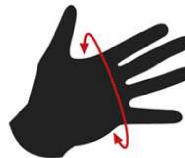
HOW TO MEASURE HAND CIRCUMFERENCE WITHOUT THUMB